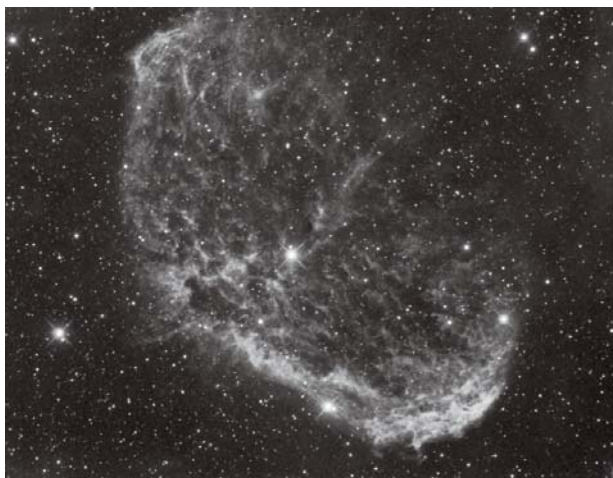
This shot of the Crescent Nebula in Cygnus was recorded during a night of unusually good seeing for the author's location. Stars are only about 1\frac{1}{2} arcseconds in diameter in this 290-minute exposure made through a hydrogen-alpha filter. All astronomical images in this review were processed by Sean Walker.

As the astrophotos accompanying this review will attest, the scope produces great images. During one night