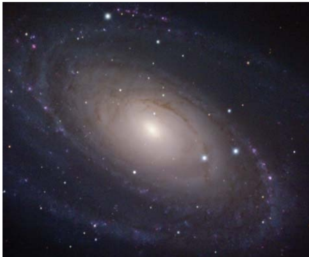
The AT14RCT is noteworthy for its remarkable focus stability. Despite falling temperatures, the author never refocused the scope during the 7-hour period when he gathered the red, green, and blue exposures for this view of the spiral galaxy M81.

scope so that the instrument can settle to ambient temperatures. If I don't, sudden temperature changes often distort telescope mirrors enough to make them temporarily unusable. This wasn't the case with the AT14RCT, which continued to perform well optically as the mirrors were cooling. Temperature acclimation, which is sped up by running the fans behind the primary mirror, is still important, because heat plumes rising from the warm mirrors can cause flaring on star images.